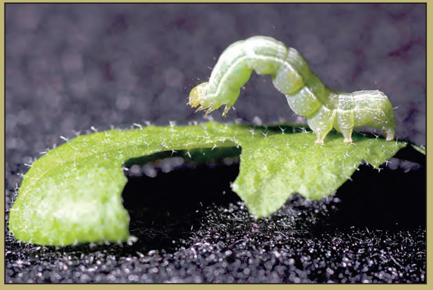
MSU has successfully engineered a plant with oily leaves—a feat that could enhance biofuel production as well as lead to improved animal feeds.