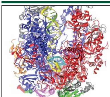
This image is from a multi-scale simulation of RNA polymerase II done by the Feig lab to understand details of the transcription mechanism.

is repeated millions of times to create snapshots of evolving protein structures.